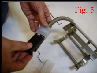
Fig.5 Close the cover of the battery compartment