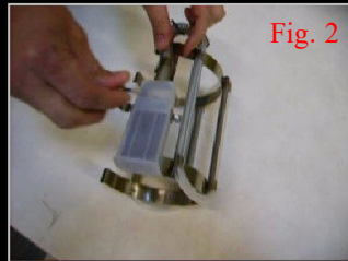
Fig.2 Remove the clip