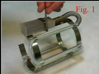
Fig.1 Unscrew the lockscrew