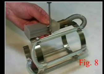
Fig.8 Tighten the screw too ensure that the silicone cover seals the inverter

Visit www.texconlight.se for instruction on video