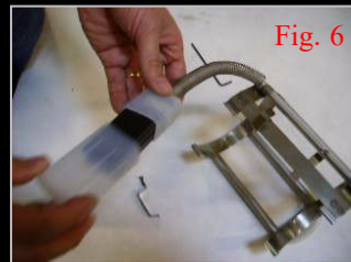
Fig.6 Remount the Silicone hood