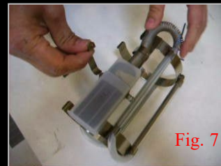
Fig.7 Remount the clip