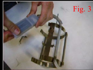
Fig.3 and 4. Lift up the whole unit and pull the hood gently backwards to open the battery compartment